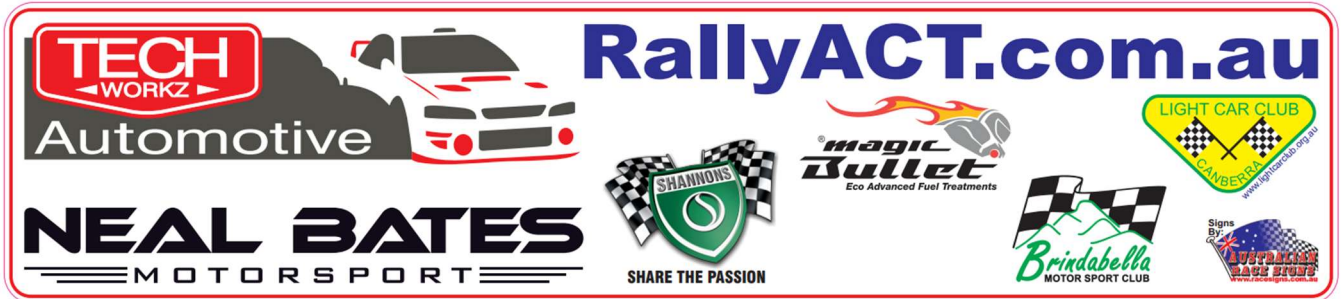
Example A: ACT Regional Rally Series Sponsors

The ACT Regional Rally Series Sponsors will receive complementary registration for one (1) category, one (1) driver, and one (1) co-driver in the 2026 ACT Series. All other Series conditions apply to sponsor entrants.