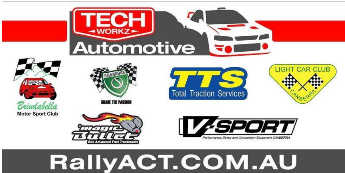
Example A: 2023 ACT Regional Rally Series Sponsors Sticker

The ACT Regional Rally Series Sponsors will receive complementary registration for one (1) category, one (1) driver, and one (1) co-driver in the 2023 ACT Series. All other Series conditions apply to sponsor entrants. Should the co-driver be